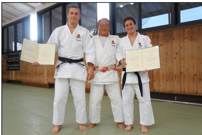
Accepting foreign instructors and students