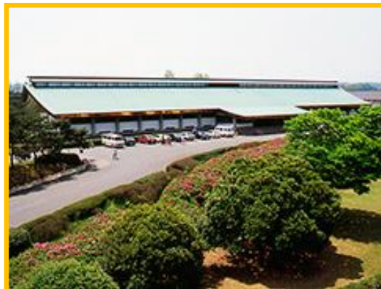
Tokai Univ. main campus