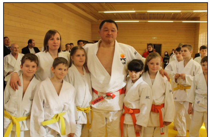
Dispatching instructors and students