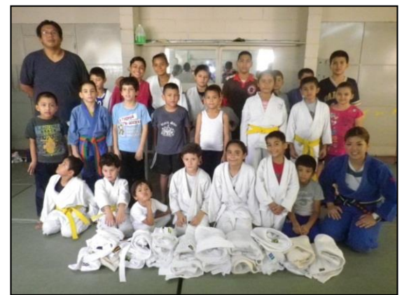
Donating recycled Judogi and Tatami mats